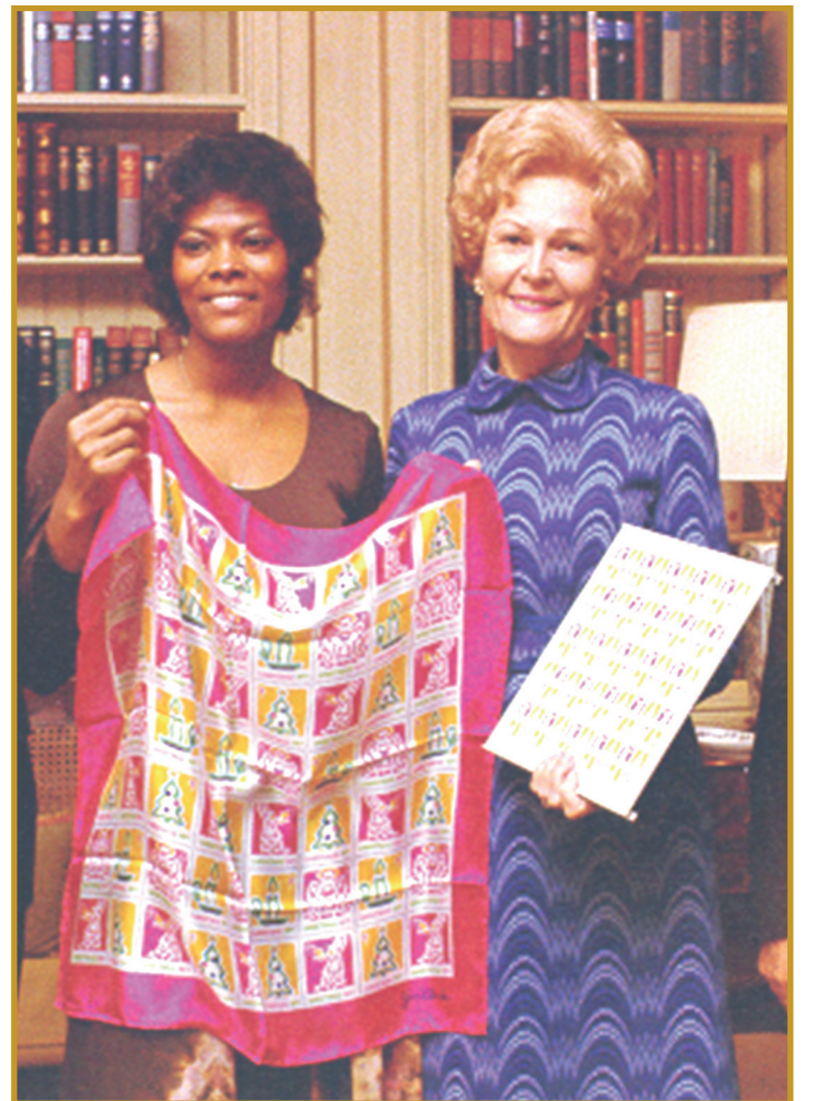
PHOTO CAPTION - Dionne Warwick with former First Lady Pat Nixon

East Orange is also the home of the prestigious Dionne Warwick Institute of Entrepreneurship and Economics, located at 120 Central Avenue. Ms. Warwick is a staunch supporter of the school, as well as educating our youth.