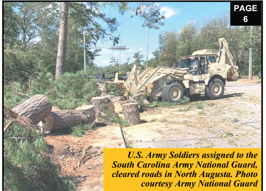
U.S. Army Soldiers assigned to the South Carolina Army National Guard, cleared roads in North Augusta.