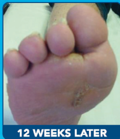
12 WEEKS LATER