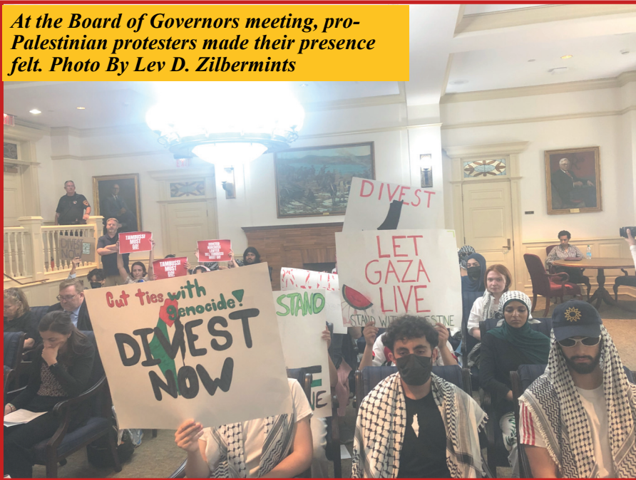
At the Board of Governors meeting, pro-Palestinian protesters made their presence felt.