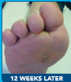
12 WEEKS LATER