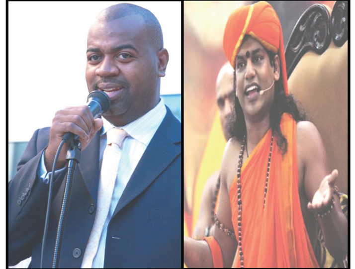
When it comes to Sister Cities, the city is still feeling embarrassment over getting “catfished” by a fake state