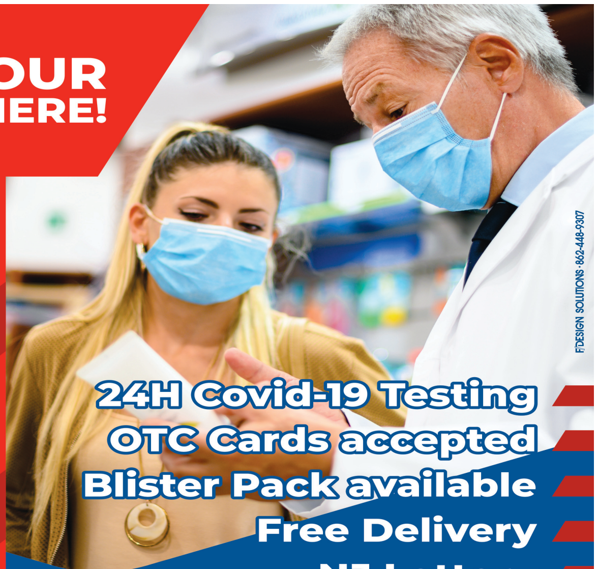
FDESIGN SOLUTIONS · 862-448-9307

13 William Street Newark, NJ 07102 973-500-3660 newarkrxpharmacy@gmail.com