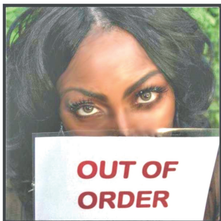
WATCH & PRAY!