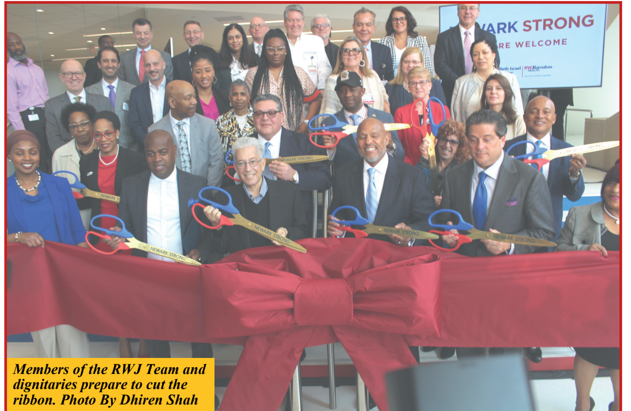
Members of the RWJ Team and dignitaries prepare to cut the ribbon.