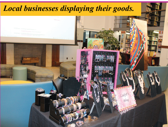
Local businesses displaying their goods.