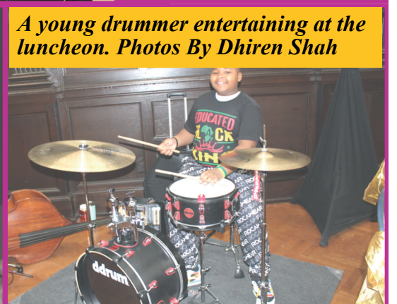
A young drummer entertaining at the luncheon.