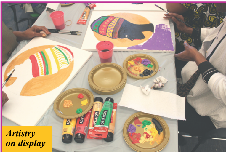
Artistry on display

The Greater Newark Women's Assembly planning team thank all who helped and were in attendance, who witness this sincere effort to plant some new seeds, for a greater harvest, nurtured through love, recognition, and honor for the Women of Greater Newark.