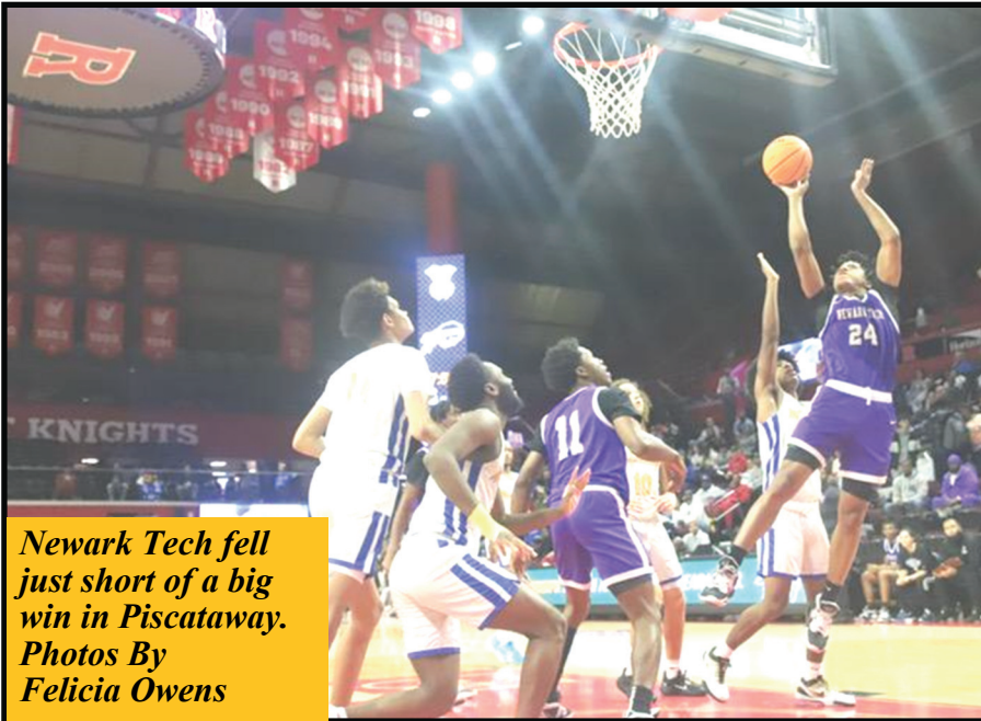
Newark Tech fell just short of a big win in Piscataway.