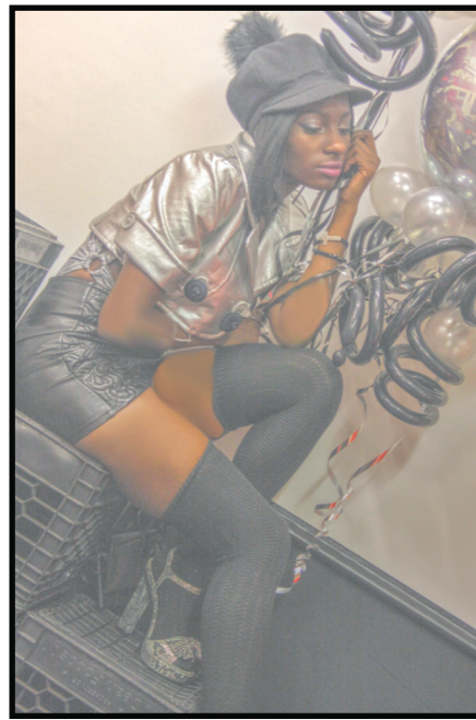
NOTE TO SELF