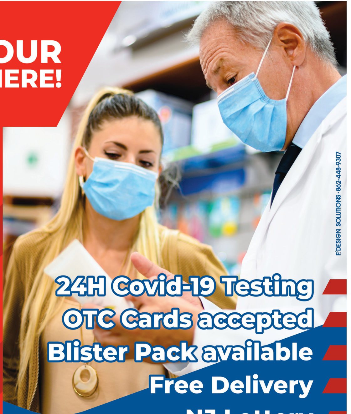
F/DESIGN SOLUTIONS · 862-448-9307

13 William Street Newark, NJ 07102 973-500-3660 newarkrxpharmacy@gmail.com