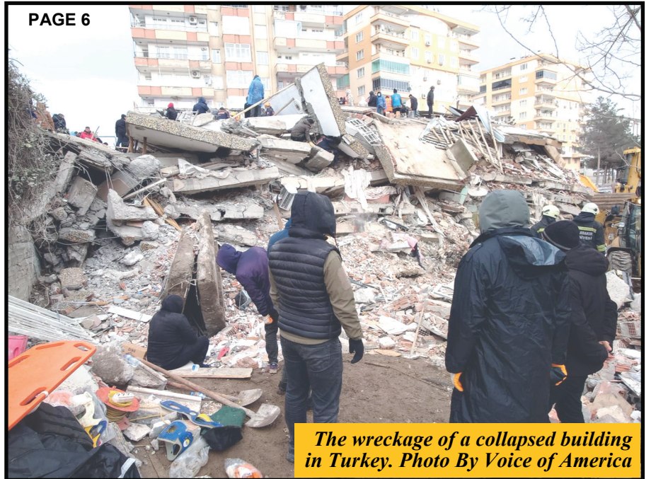
The wreckage of a collapsed building in Turkey.