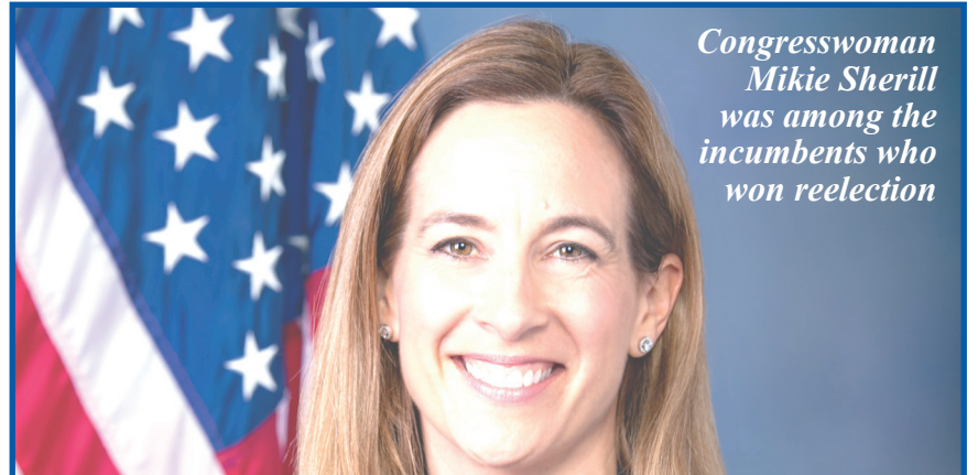
Congresswoman Mikie Sherill was among the incumbents who won reelection