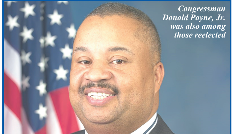
Congressman Donald Payne, Jr. was also among those reelected