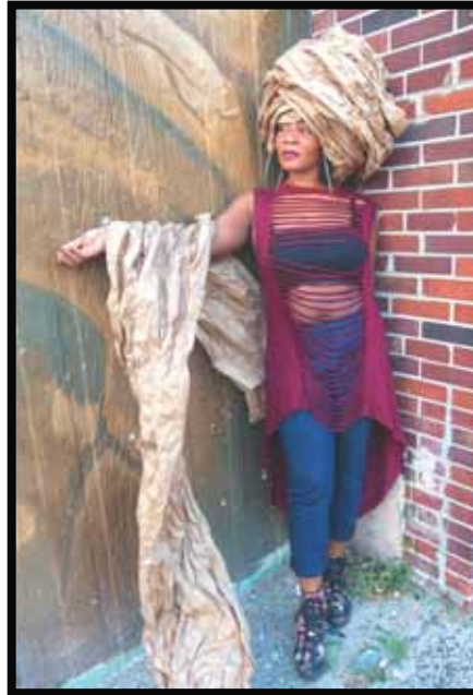
Photo Credit & Styling: Andrea Dialect L.I.T Editorial Muse: Glam Warrior