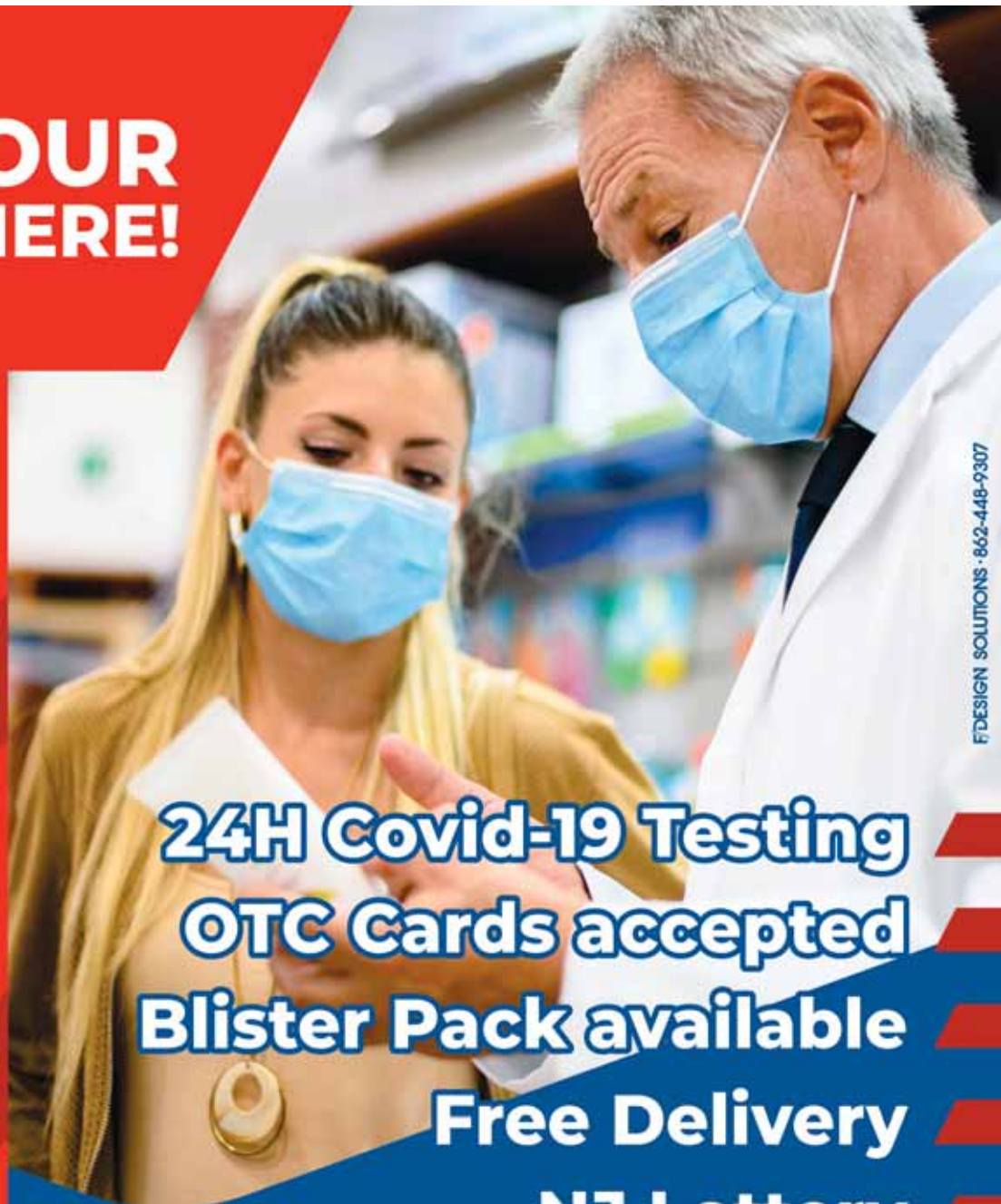
FDESIGN SOLUTIONS · 862-448-9307

13 William Street Newark, NJ 07102 973-500-3660 newarkrxpharmacy@gmail.com