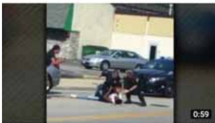
Victim's attorney: Euclid will pay

Video footage I saw just make me vomit. All police officers aren't like this, but it makes us citizens so scared to dial 911 for help, depending on your race. Will you fall for being victimizing by a police officer?