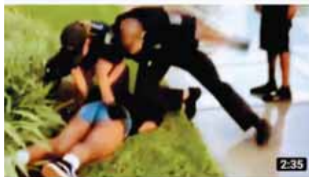
Mother says video of daughter's arrest shows police brutality

This isn't going to stop. They need to make police officers get a thorough background