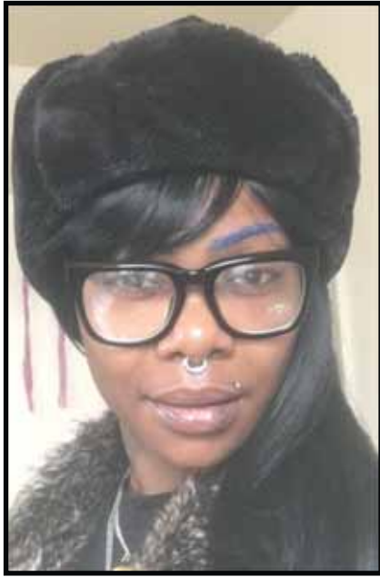
By Michele Lowe

September has come to an end. Now October is here. We have lost a lot lately. The storm especially was a tragedy alone. Flooding, cars floating, I have never seen highways done the way Ida did. Blackouts all over towns sort of like Sandy. I'm sure you all remember. No one expected the storm to destroy things like this one. When you least expect, it can just go black in the blink of an eye.