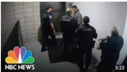
Police Beating Unarmed Man In Mesa, Arizona | NBC News

All police officers should turn in their guns until they know when exactly to use them. Drawing a gun should not be how they introduce themselves to anyone. I am totally against police brutality. My vote has been in dealing with all those lost by their hands. How long will this continue?