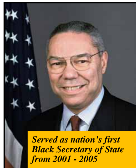
Served as nation's first Black Secretary of State from 2001 - 2005

After George W. Bush was declared as the winner of the 2000 Presidential Election, the son of Powell's former boss appointed the longtime military man as his Secretary of State. Powell was the first black person to serve in that capacity, and it was the highest post achieved in the nation's government by someone black at that time, just years before