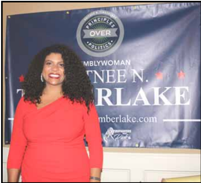
Assemblywoman Britnee Timberlake held an event at Libretti's Restaurant in Orange on October 14 in support of her re-election campaign.