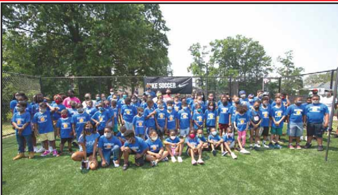
Bo Porter Summer Enrichment Campers at the kick-off event of the new soccer field, a partnership with PDA Urban Initiative, the City of Newark, Newark Beth Israel Medical Center and RWJBarnabas Health.

The nine were picked from the 50 enrichment camp members, ages seven through 13, who first