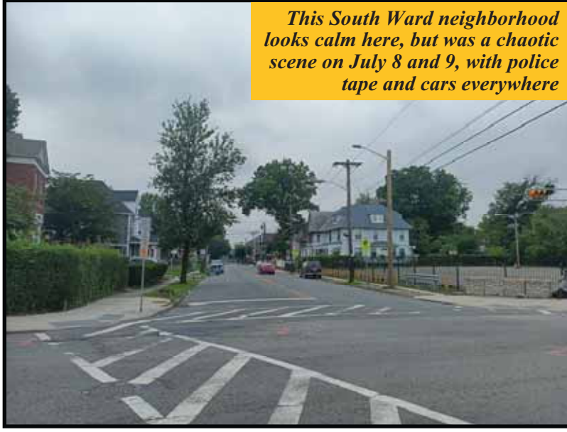
This South Ward neighborhood looks calm here, but was a chaotic scene on July 8 and 9, with police tape and cars everywhere