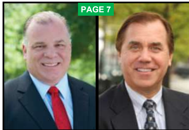
NJ State Senators Steve Sweeney (left) and Craig Coughlin (right) brokered a deal with Governor Phil Murphy to end the emergency order that was put in place in the wake of COVID-19.

VOLUME 21 • ISSUE 31 * JUNE 10, 2021 - JUNE 16, 2021