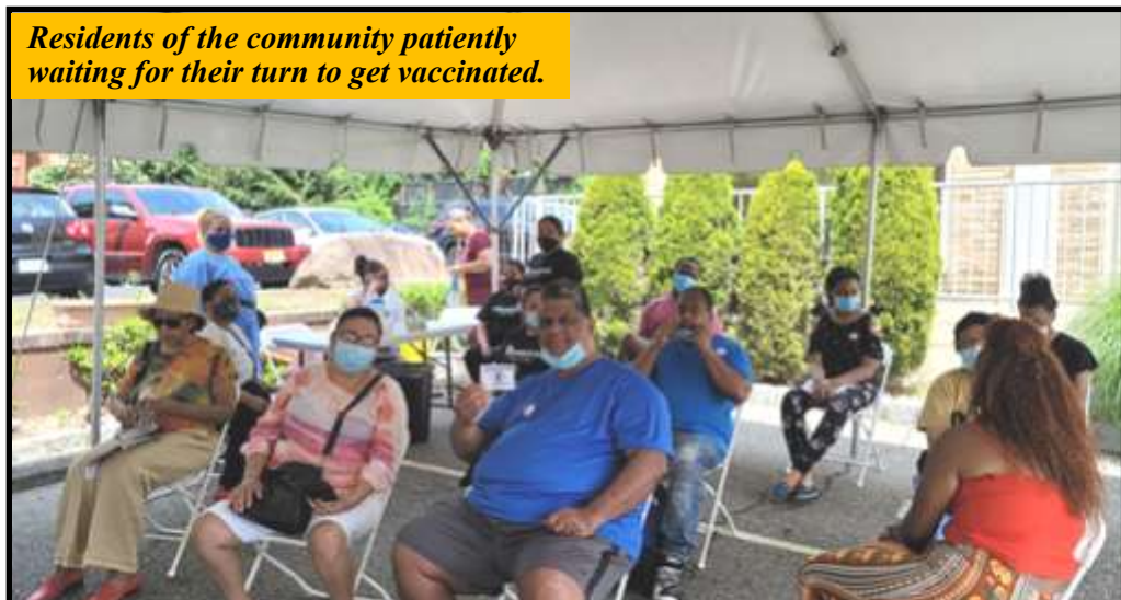
Residents of the community patiently waiting for their turn to get vaccinated.

On June 8th, Local 108 and Essex County once again partnered to vaccinate the community against COVID-19.