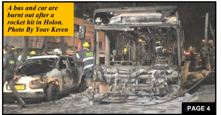
A bus and car are burnt out after a rocket hit in Holon.