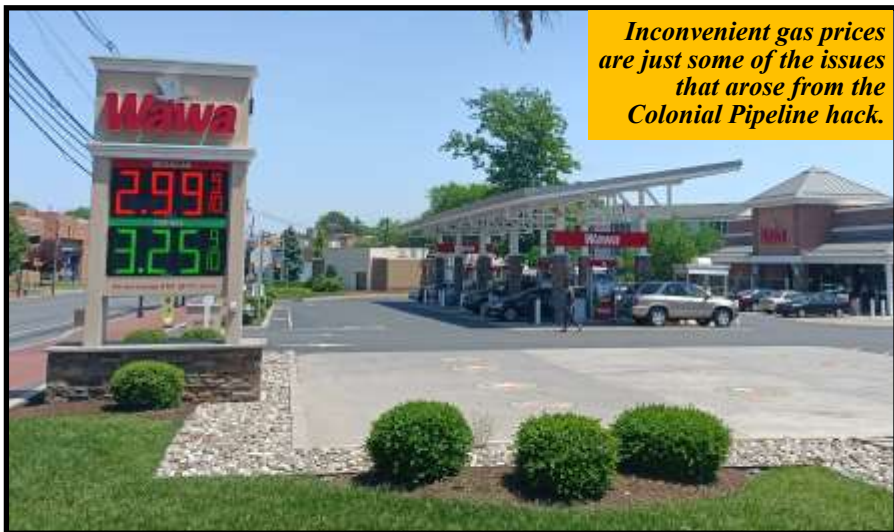
Inconvenient gas prices are just some of the issues that arose from the Colonial Pipeline hack.