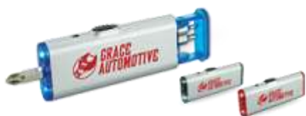
Show Your Appreciation for Your Customers in this Pandemic