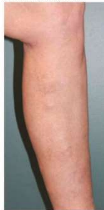
Varicose Vein Treatment